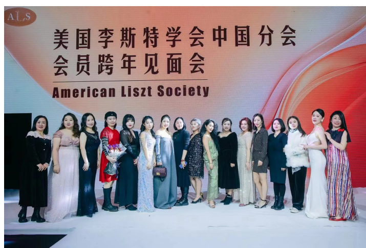
From the opening ceremony, December 2023