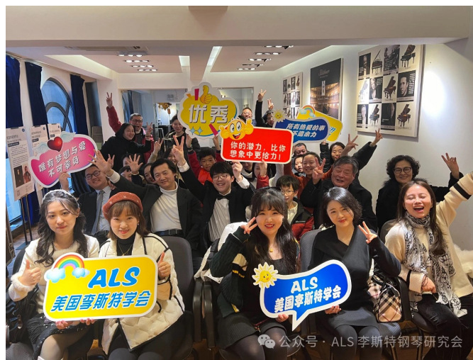
(From the salon workshop held after the opening ceremony)